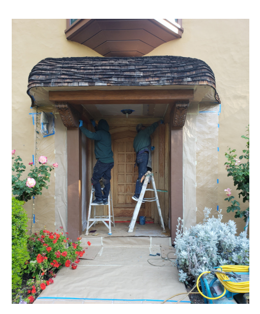
In 2022, the Campbell Museum Foundation funded the restoration of the Ainsley House front door.

Our museums encompass three historic structures, four collection storage sites, over 11,000 artifacts, rotating exhibits, and a variety of long-standing community programs. To keep it all running, we rely on the invaluable support of the Campbell Museum Foundation—an all-volunteer nonprofit that provides critical funding for preservation, exhibitions, and education. Together, the City of Campbell and the Campbell Museum Foundation ensure that our shared history is not only protected but continues to inspire and educate for generations to come.